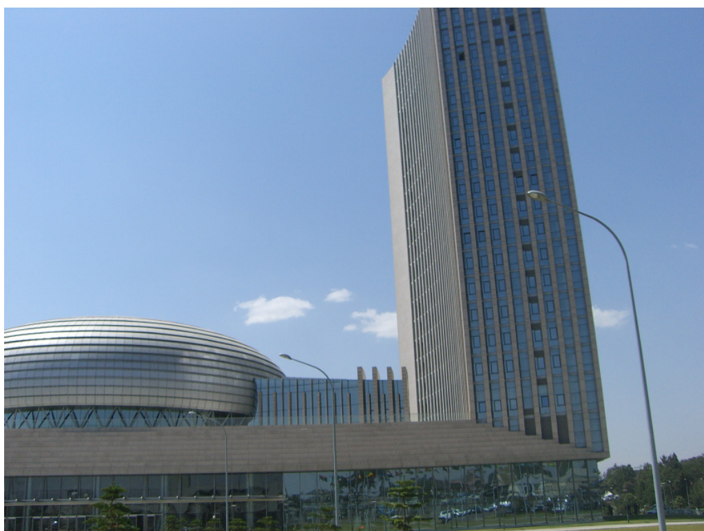
African Union Commission Headquarters, Addis Ababa